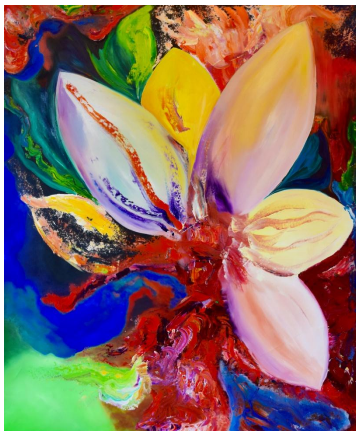
Contagion-oil on canvas-182X152cm

Text and photos available on demand from isabelle.van.rollegem@oenobrand.com Online catalog available from www.laurelholloman.net