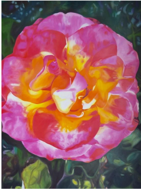
Provence oil on canvas 121x91cm

The Everglow series of back paneled LEDs is representative of our current global warming issues. Each piece is a combination of ice and fire, representing the inevitable melting we have witnessed in our farthest reaching climates. "We cannot deny at this moment we are dependent on nature for our survival. Put simply, science doesn't lie" L.H.